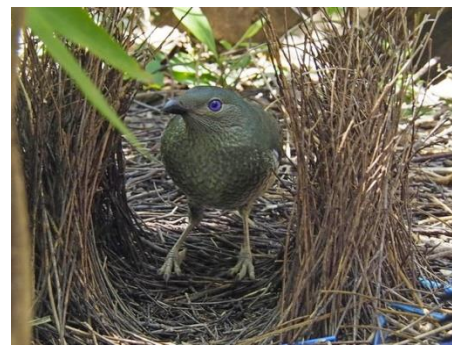
Female Satin Bowerbird

Nigel has placed his bower in the side yard of the Honeymoon Cottage (so if you go to Binna Burra book that one). You can sit on the back verandah and enjoy his comings and goings and meet his girlfriends at very close range. He doesn't mind humans at all and often hops along the verandah near your feet. The occupants of the Cottage invited us to sit on the verandah so we were very lucky. (Luckily they were not on their honeymoon but they knew Nigel was a bonus.)