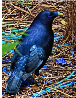
Male Satin Bowerbird - Nigel

Our delight was a Satin Bowerbird called Nigel NoFriends by the locals. Apparently, when he first built a bower, many years ago, he didn't have much luck attracting the girls. He has come on in leaps and bounds ever since.