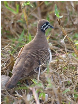
Squatter Pigeon Annette Sutton

Scrammy Gorge for a late lunch, but not before hunting through the spinifex for elusive sightings of Emu Wrens. The weather was deteriorating with increasing cloud and wind, distant storms on the horizons and spits of rain. A quick check to ID a pair of Crested Bellbirds then time to head back to let the ranger know we were OK and get off the black soil plains. The day had one more treat for us as we moved off for home. A pair of Crimson Chats near the road followed by a flash of colour. A small flock of Orange Chats flew into some Acacia scrub next to the 4WD just before the creek crossing. How good is that?