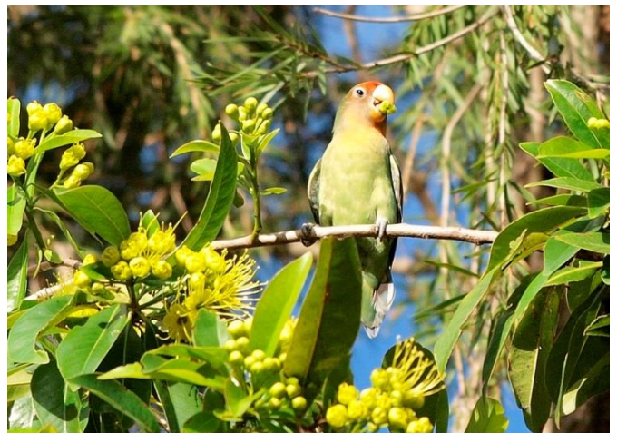
Two fugitives who took refuge in Acton's garden.