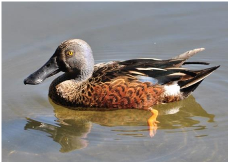
Australian Shoveler Peter Valentine

Grey Currawongs were flushed from a eucalypt tree and a single Grey Fantail sang and danced beautifully. It was the white-tailed subspecies, extremely distinctive. Of course there were plenty of more common inland species including Galah, Crested Pigeon and Mistletoebird. A pair of Zebra Finches was nest-building, presumably in response to the early March rainfall. Small groups of Little Crows flew over and Magpies and Magpie-larks were also seen. Raptors were scarce but we did see a single Brown Falcon flying over. A solitary Australian Pipit rounded out the list.