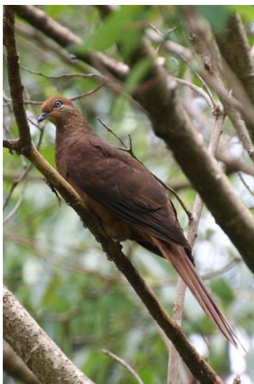
Brown Cuckoo-Dove