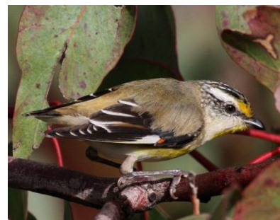
Striated Pardalote