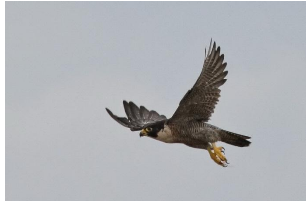
Peregrine at Cluden

Peregrines seen, none heard, the young male had perhaps made the kill himself, as now 10+ weeks post-fledgling.