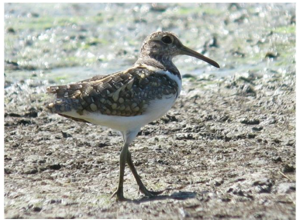
Australian Painted Snipe

Well there it was: - A male Australian Painted Snipe. (APS) Hi fives all round. A few cattle rushed by between us and the Snipe, which made it duck for cover for a few minutes. Len wanted to stealth a bit closer for some better digiscope images, so I walked off to see what else I could find.