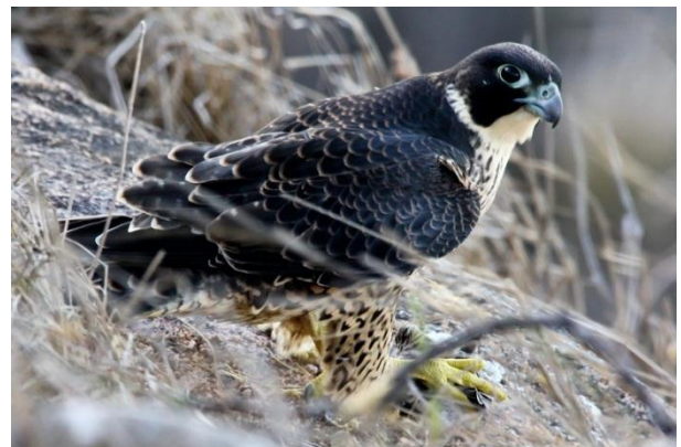
Female Peregrine fledgling with Peaceful Dove prey, Castle Hill

21/11/2011 17:30 - Female fledgling on a rock on hilltop feeding on possibly a Wompoo Pigeon. Unfortunately we were a few minutes too late to see the delivery by the parent and also were unable to clearly confirm the prey i.d. for various reasons. At least one brother also had a very full crop. For the first time in several visits we saw all three fledglings playing around together in spectacular dives and chases around the windy summit for about half an hour. Parents not seen. At dusk we were finally able to follow sister and one brother to their roosts for the night; on the east cliff near the "Saint", below the furthest viewing platform, the two siblings settling down on separate small ledge perches, one about 15 metres below the other. Third fledgling possibly settled further east around the cliff-face, out of our view. We left when it got too dark to see, around 19:15. Interesting to note the roosting fledglings chose to roost within the glare of the CBD lights - why not further around in the shadowed part of cliff? Perhaps so they could more easily keep track of "breakfast" - the hundreds of noisy roosting lorikeets in the CBD trees??