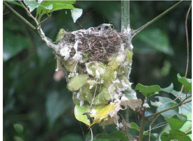
Spectacled Monarch Nest

bread on the first night; took a bit to clean out the poop! We were better prepared on the second night and had all food in the back of the car. The large goannas are still resident around the day area; apparently some senseless idiots rode their motor bikes into the park after the cyclone (via Abergowrie) and shot and killed one of the goannas. There were no flying foxes in residence; possibly loss of suitable roosting trees. Pretty Faced