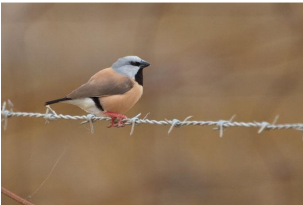
Oak Valley October 2012

BirdLife members have provided valuable support to these projects and there will be many other opportunities to support this important research over the coming months. Please continue to report any BTF records to the website ( http://www.blackthroatedfinch.com ) particularly if banded birds are sighted.