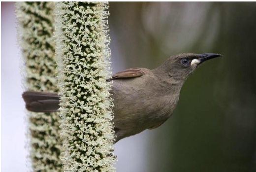
White-gaped Honeyeater Annette Sutton

Some of the birds I have seen here include:- White-headed Pigeon (fabulous view), Spotted Dove, Helmeted Friarbird, Yellow-spotted, Brown-backed, Lewin's, White-gaped and Scarlet Honeyeaters. Pied Currawongs and Laughing Kookaburras greet every morning bright and early.