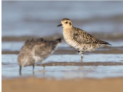
Pacific Golden Plover with tag

On the 19th March 2016 I thought I'd go down to Bushland Beach in the afternoon to see if any waders were around that might like their photo taken. After the long walk up to Black River I was rewarded with some Great and Red Knots, Greater and Lesser Sand Plovers,