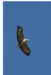
Buzzard Ray Sutton

Returning to Rhaeadr mid-afternoon we drove along muddy farm tracks to the Red Kite Feeding station farm. Four wooden bird hides have been built forming a semicircle looking out onto a sloping field, with at least 50 circling birds and potential "kite-watchers" already in attendance: plenty of room for photographers though, especially if you were prepared to pay LE 10 for a spot in the up market tower hide.