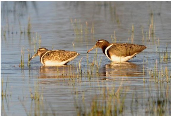
Australian Painted Snipe

In anticipation of the need for port expansion, the Queensland Government approved Abbott Point Port development (near Bowen) in 1981. The Port commenced operations in 1984. The idea was to select a site that had relatively deep water close in shore and was better able to be developed and expanded without impacting directly on the Great Barrier Reef. Such forward thinking was unusual in Queensland and placed the future expansion of mining and related shipping on a sound basis, assuming of course that the Port was well managed.