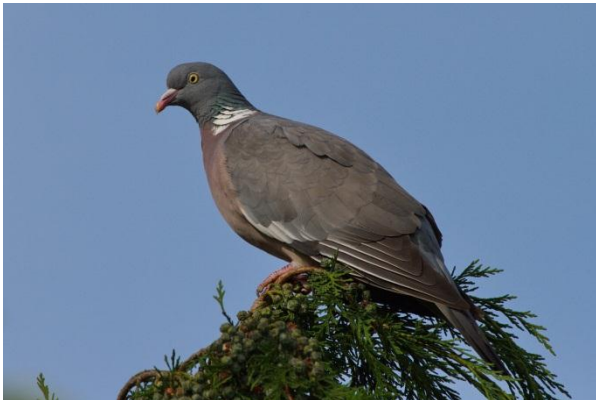
Wood Pigeon Ray Sutton

decided to go walking in the Somerset levels and find a few birds. The Avalon marshes are one of several Nature reserves in this region, centred around the village of Shapwick. Bridle paths took us through woodlands of alder, ash and oak then fens and wide rhyals (flooded ditches), but with very little bird activity. A few flocks of remnant Starlings wheeled overhead, noisy Jackdaws, Wood Pigeons calling, and small family groups of Robins were feeding on late blackberries...a very short list! Morning tea at the local RSPB Centre, then a browse through the Somerset Craft Centre, before returning home as the clouds had gathered and the first spots of rain on the windscreen meant the end of outdoor activities for the day and a return to the usual English weather!