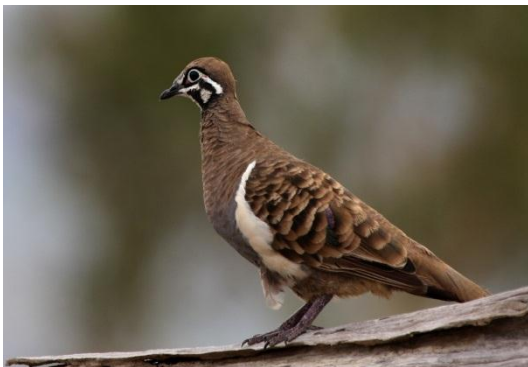
Squatter Pigeon Ray Sutton

The count methodology follows a carefully designed protocol. Each waterhole is monitored for two consecutive days, from 6am to 9am, recording the number of each species of seed-eating birds that drink in each 15-minute interval. The species recorded are each of the local grass-finch species (Black-throated, Chestnut-breasted, Crimson, Double-barred, Nutmeg, Pictorella, Plum-headed, Red-browed and Zebra) plus Diamond Dove, Crested and Squatter pigeons. This methodology means that we actually count the numbers of drinking events rather than the number of birds. This gives an index of bird abundance rather than an actual population estimate.