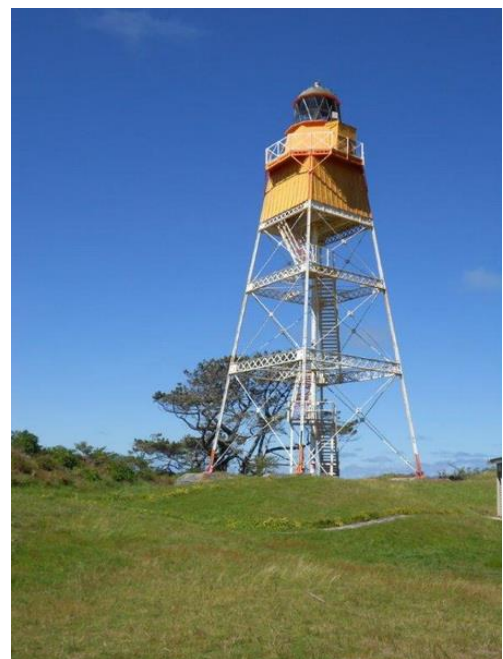
Farewell Spit Lighthouse NZ Graeme Cooksley