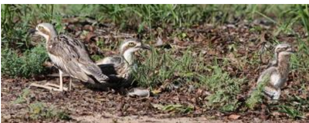
Bush Stone-curlew Family