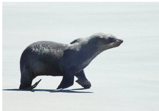
New Zealand Fur Seal

After leaving the colony, we headed back up the Spit, and stopped at the lighthouse and the three light house keepers cottages for afternoon tea. The light house is in remarkable condition for a 116 years old steel structure. Now fully automated and electric, the houses are no longer in use. There is a complete Minke Whale skeleton on view near the lighthouse.