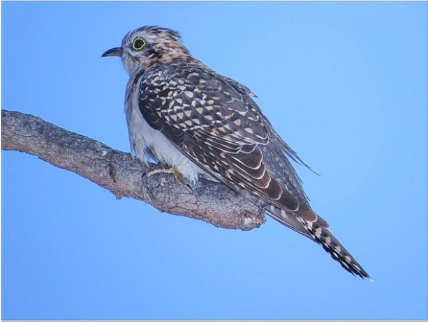
Pallid Cuckoo female Rufous Morph Len & Chris Ezzy