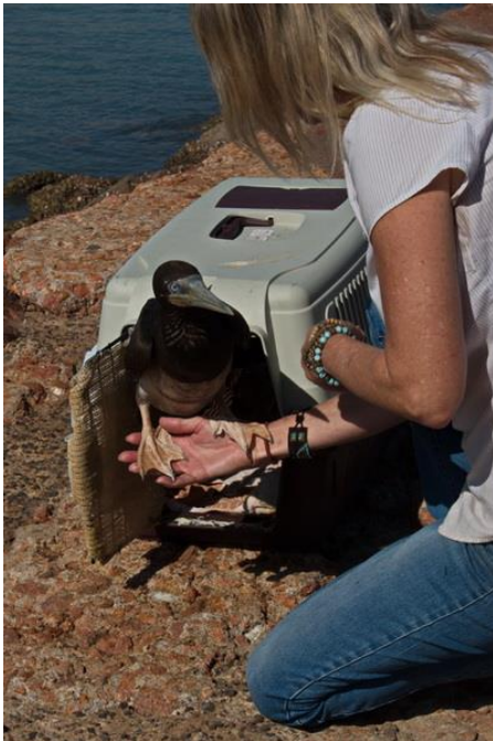
Bob arriving for release

Bob is a Brown Booby and, when first seen, was sitting quietly on a rock, just behind the dugong sculpture near the fishing pier. A little girl was trying to chase him so immediately I put on my best teacher voice and said "Please don't chase that bird. He is very special and he is sick." The child, recognising the teacher bit, asked "How do you know?" so I explained and she went off happily to inform the others in her family.