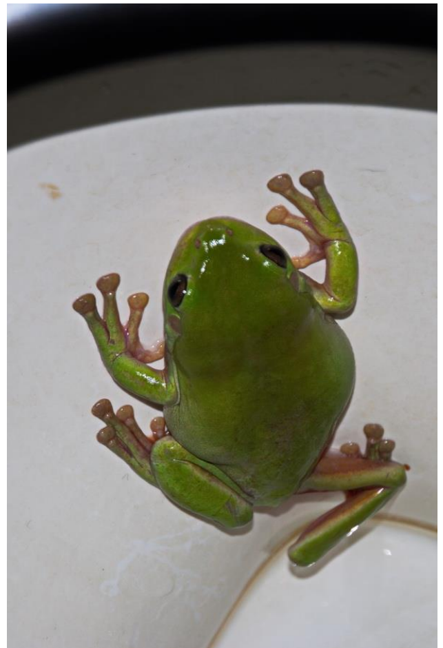
Green Tree Frog

On our way in along Buck's Road we saw two adult Brolgas and two juveniles at the dam and there was a White-faced Heron there as well. Coming back we encountered a flock of fifteen or so budgerigars. They were wanting to land at the side of the dam but a hovering Black Kite kept them moving.