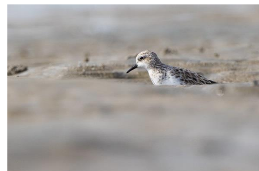
What I was doing when the sea swallowed me